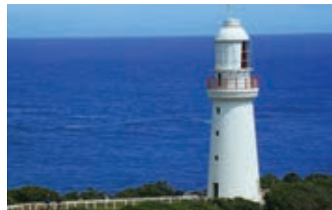
Cape Otway Lighthouse

The Roe v. Wade decision, handed down on January 22, 1973, overturned pro-life laws offering protection for unborn children in most states across the country, and made abortions legal and virtually unlimited. Almost 58 million unborn children have been killed in abortions since.