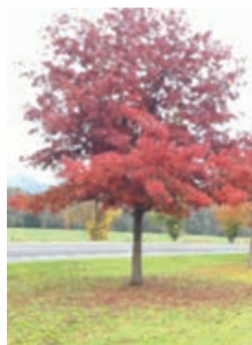
The colours of nature in Myrtleford