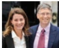
Bill and Melinda Gates.

Gates then explained that spacing "pregnancies in a safe and healthy way" is an approach that works and "saves lives," but "the question of abortion should be dealt with separately." "[I]n the United States and around the world the emotional and personal debate about abortion is threatening to get in the way of the lifesaving consensus regarding basic family planning," she said. "I understand why there is so much emotion, but conflating these issues will slow down progress for tens of millions of women."