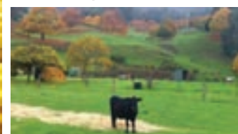
Inquisitive cows on the trail