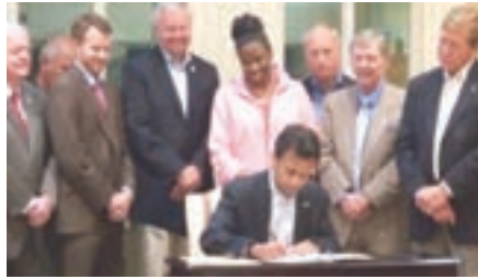
Pro-Life Louisiana Gov. Bobby Jindal signing pro-life bills into law.