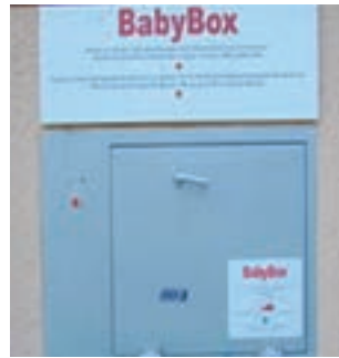
Baby hatch called "Baby Box" in the Czech Republic