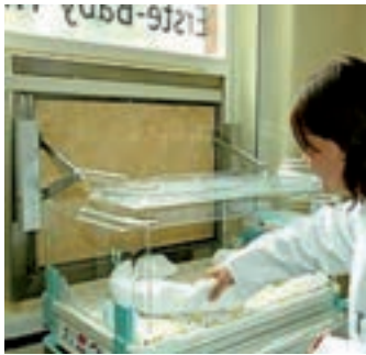
Baby hatch in Germany