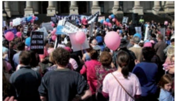
Part of the crowd