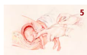
Partial-Birth Abortion www.nrlc.org/abortion/pba/PBA.Images/PBA.Images.Heathers.Place.htm