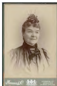
Hammer & Co. Photographers

19/7 Clarke Street, Abbotsford, Vic., 3067