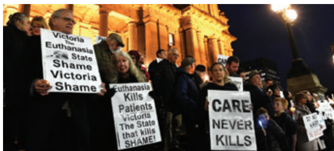
Euthanasia opponents in silent witness on the steps of the Victorian Parliament after the Voluntary Assisted Dying Act 2017 came into effect in 2019.

RTLTA opposes changing the present act to allow health practitioners to raise with their patients the whole subject of euthanasia or doctor assisted suicide as an option.