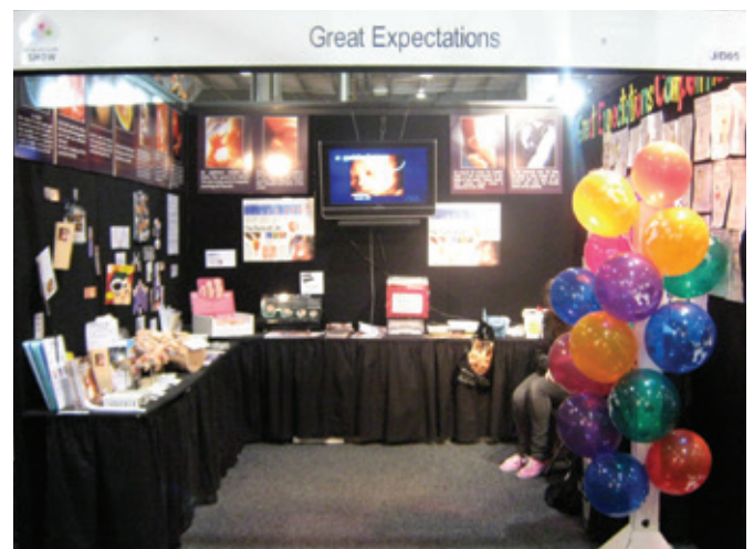
Photo: Colourful display at Life Festival, Adelaide