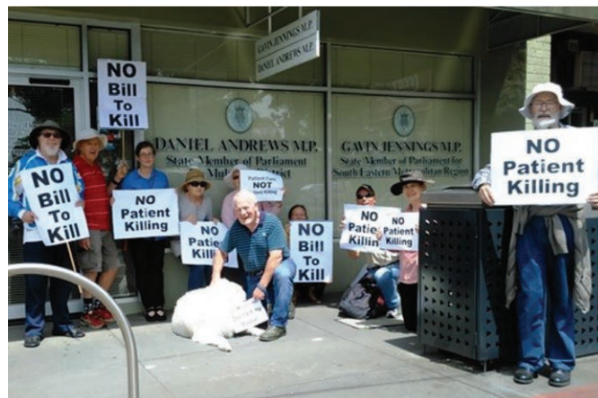
The picture above was taken at an anti-euthanasia rally, held outside the office of Victorian Premier Daniel Andrews on 1st December 2016.

...Politicians need to hear from the public about the dangers assisted suicide and euthanasia represent to vulnerable people, health professionals and to society at large.